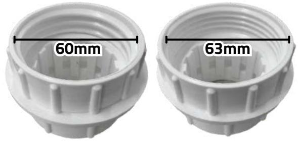
Rosca externa grossa